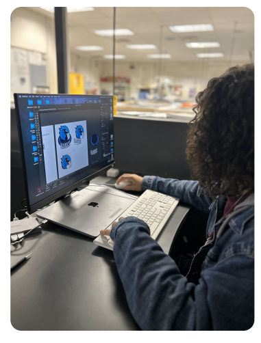
Feb. 20, 2025

Commercial Art at Brownstown have continued to work on their live work projects! Several of these projects will be used in real-world applications. Students are designing "think" posters against bullying, a logo for a local festival, a logo for the e-sports team Hempfield, and hawk art submissions for our new CTC mascot!