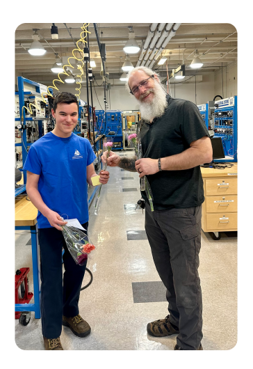
March 3, 2025

Mount Joy's NTHS chapter kicked off their final community service project with the February Carnations of Kindness Campaign! 162 carnations and positive messages were sold by our NTHS students to spread resiliency and positivity both on campus and with the outside community to "Share the Joy!"