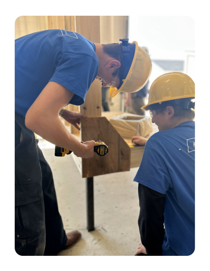
March 11, 2025

On a beautiful, blue-sky Tuesday, Brownstown's HVAC students and Willow Street's Intro to Construction programs got in the competitive spirit!